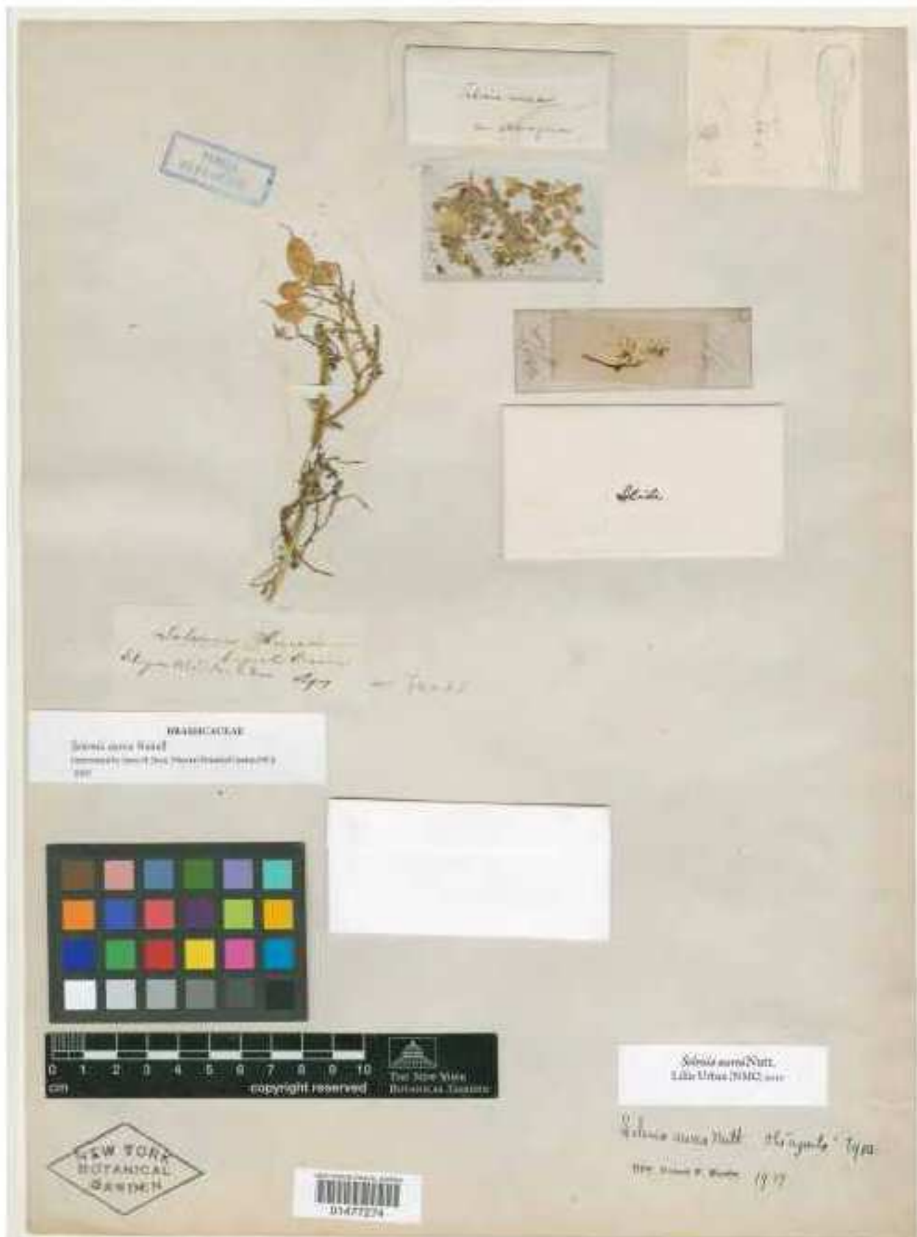
Figure 2. Selenia aurea (M.C. Leavenworth s.n.